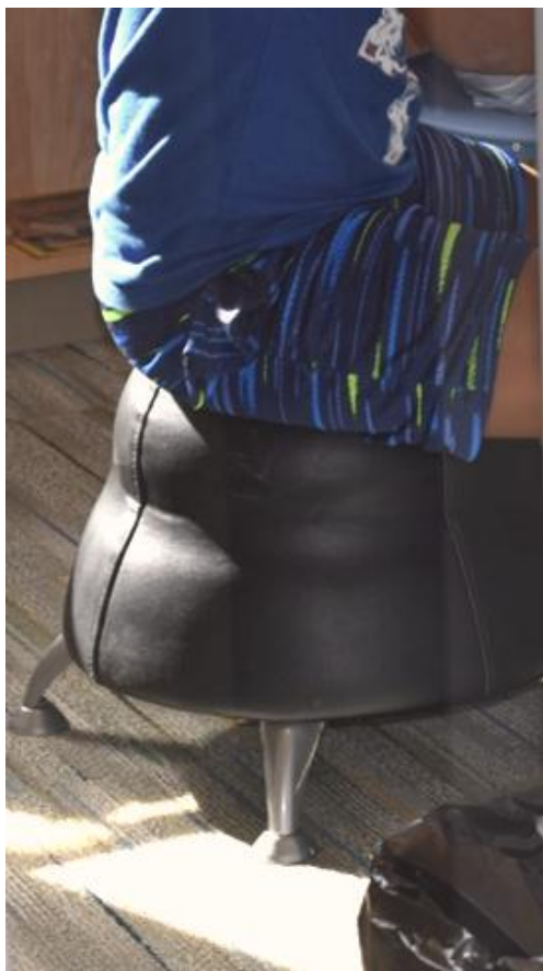
West Parish Elementary, 2016 (Gloucester)